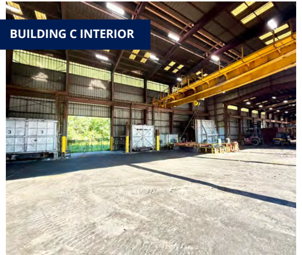
BUILDING C INTERIOR