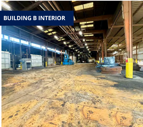
BUILDING B INTERIOR