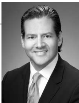
Bradford Kitchen, SIOR