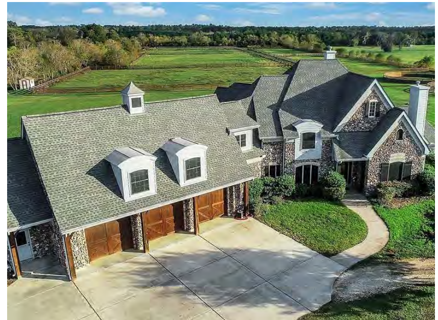
2430 Goodson Loop - 3 bed, 4 1/2 bath, ±4,675 sf