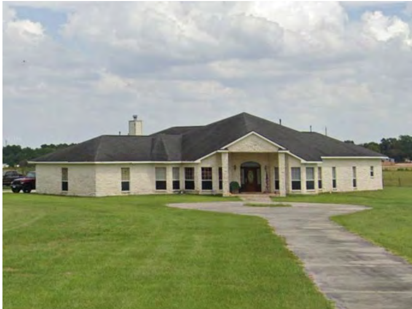
2810 Goodson Loop - 4 bed, 3 1/2 bath, ±2,866 sf