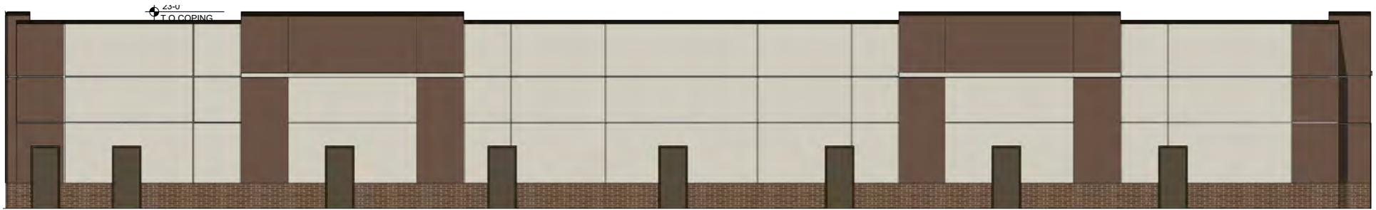
2 REAR NORTH ELEVATION SCALE: 3/16" = 1'-0"