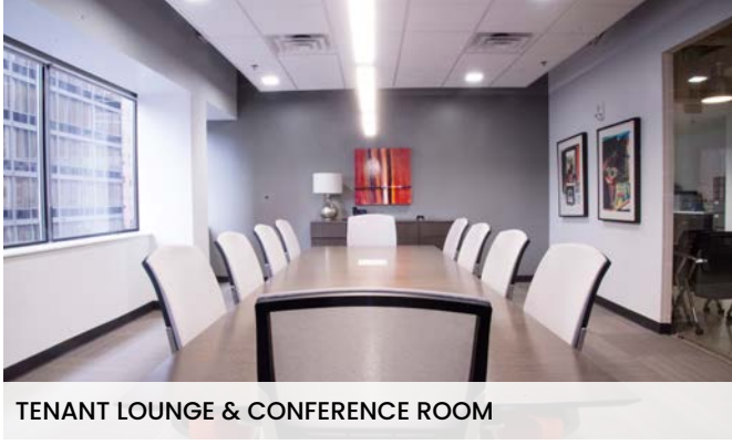
TENANT LOUNGE & CONFERENCE ROOM