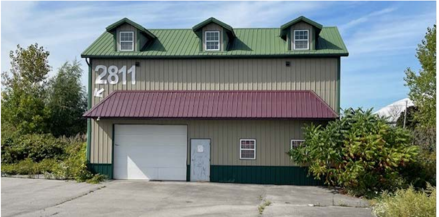
1,800 Sq Ft Warehouse