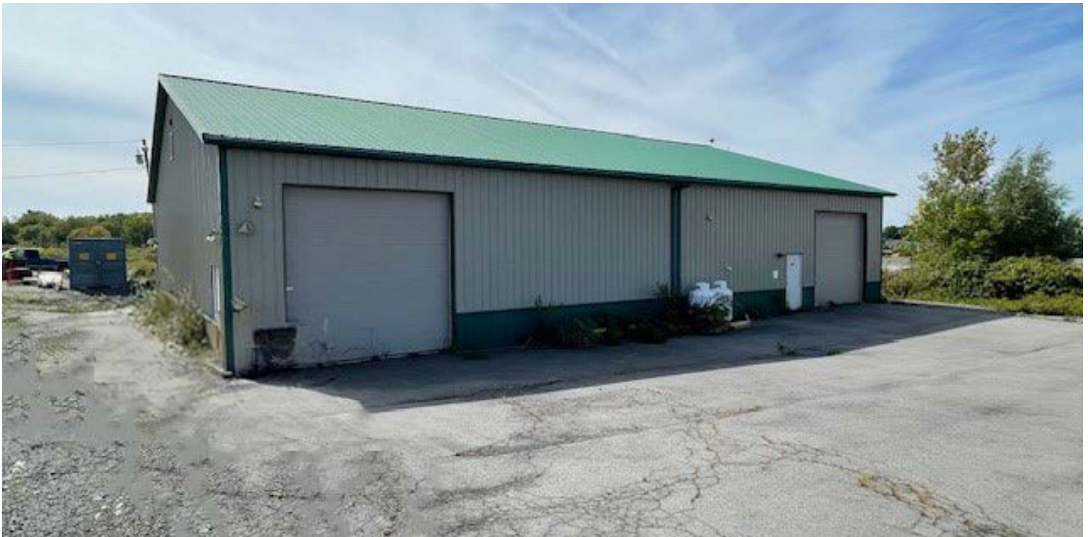
4,800 Sq Ft Warehouse