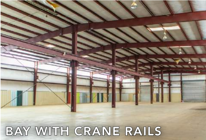
BAY WITH CRANE RAILS