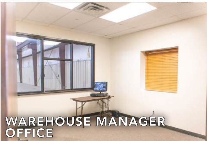
WAREHOUSE MANAGER OFFICE