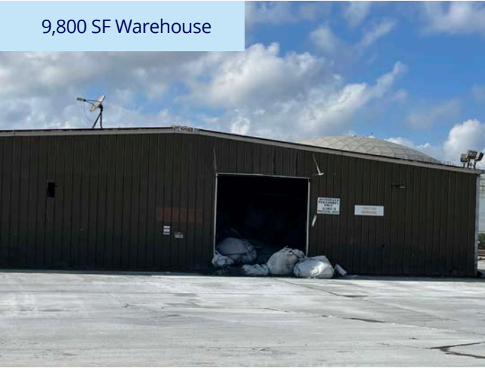
9,800 SF Warehouse