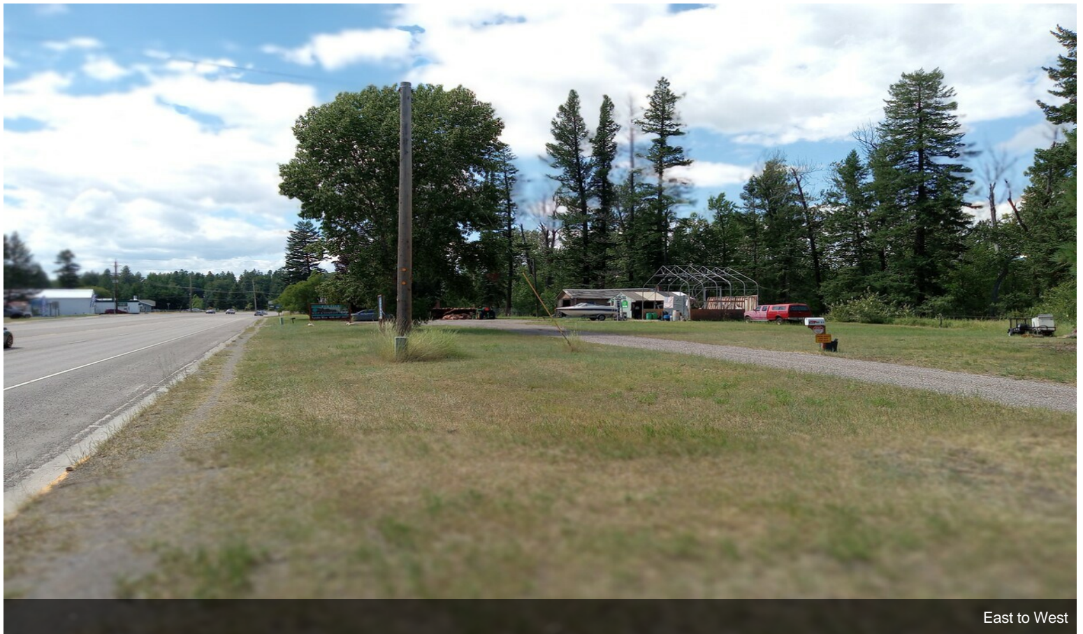
East to West