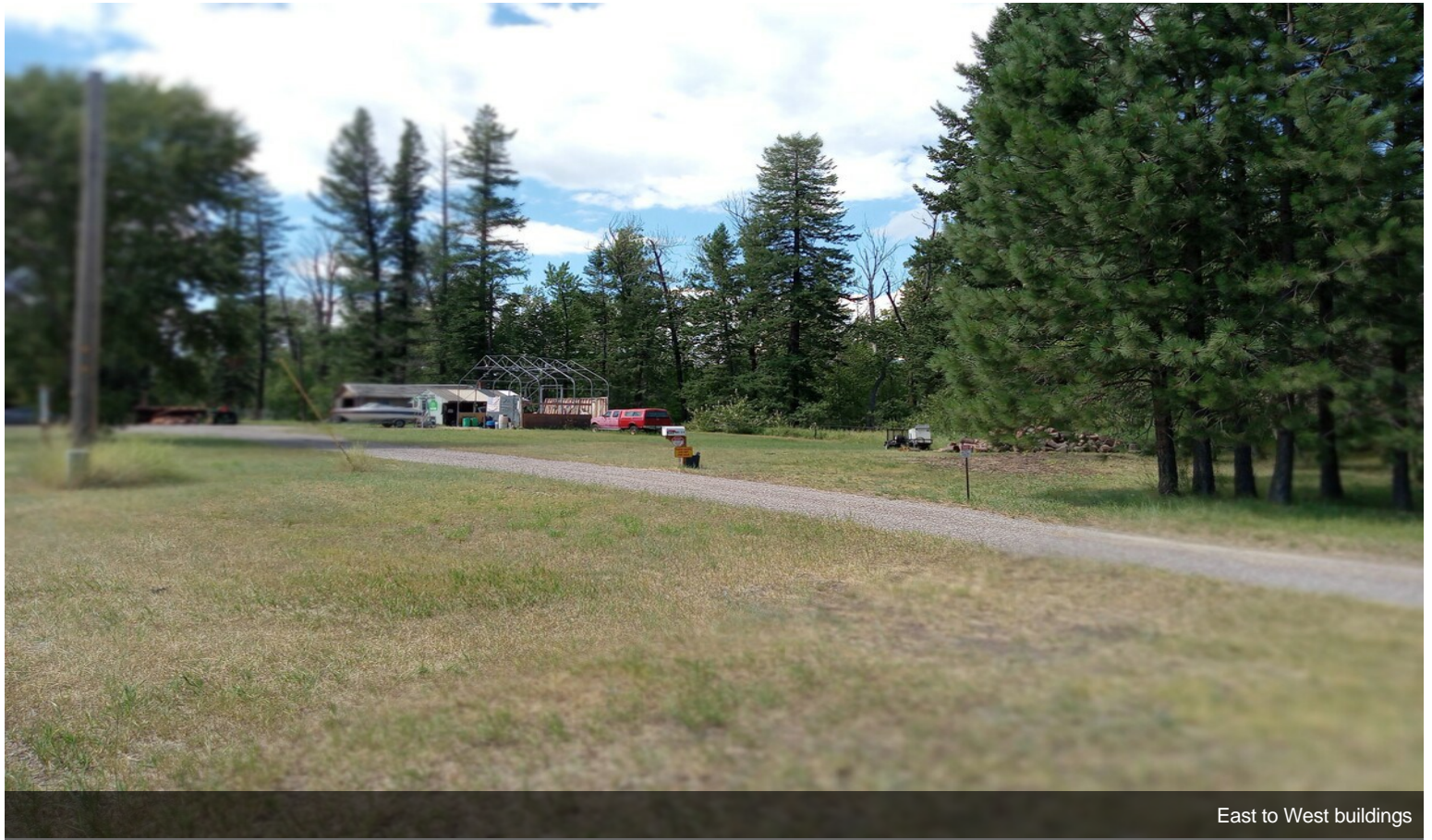
East to West buildings