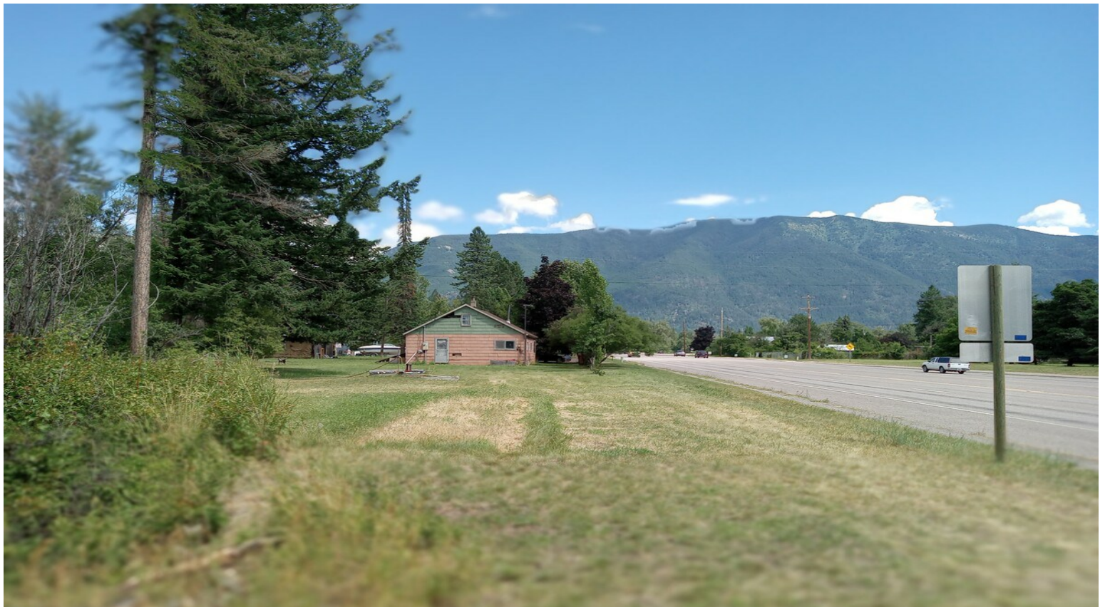
West to East