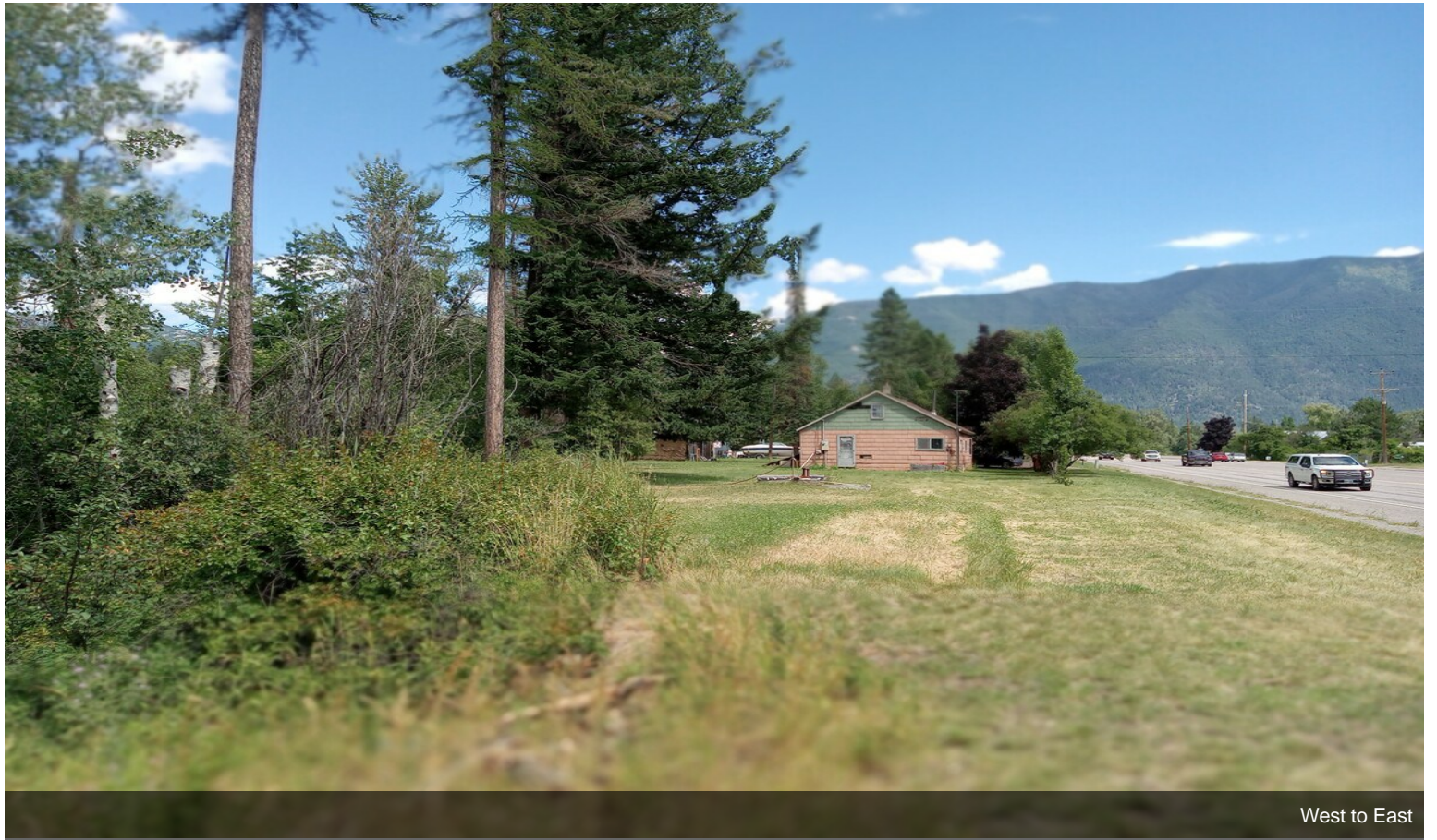
West to East