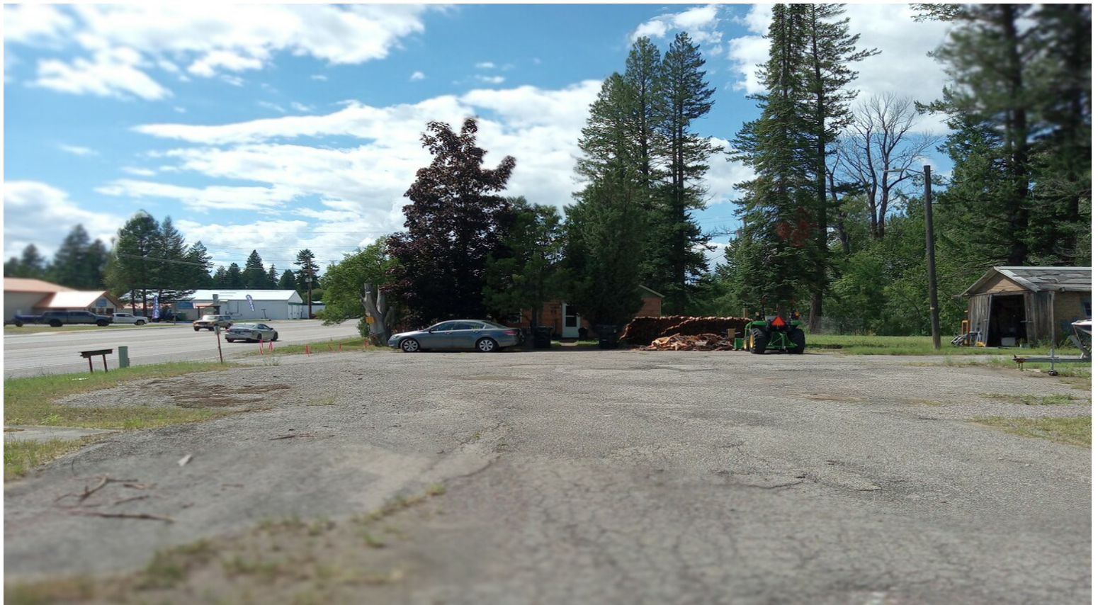
East to West