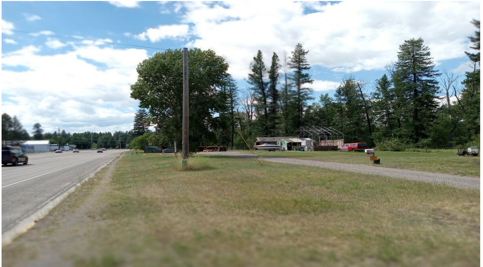
East to West Highway