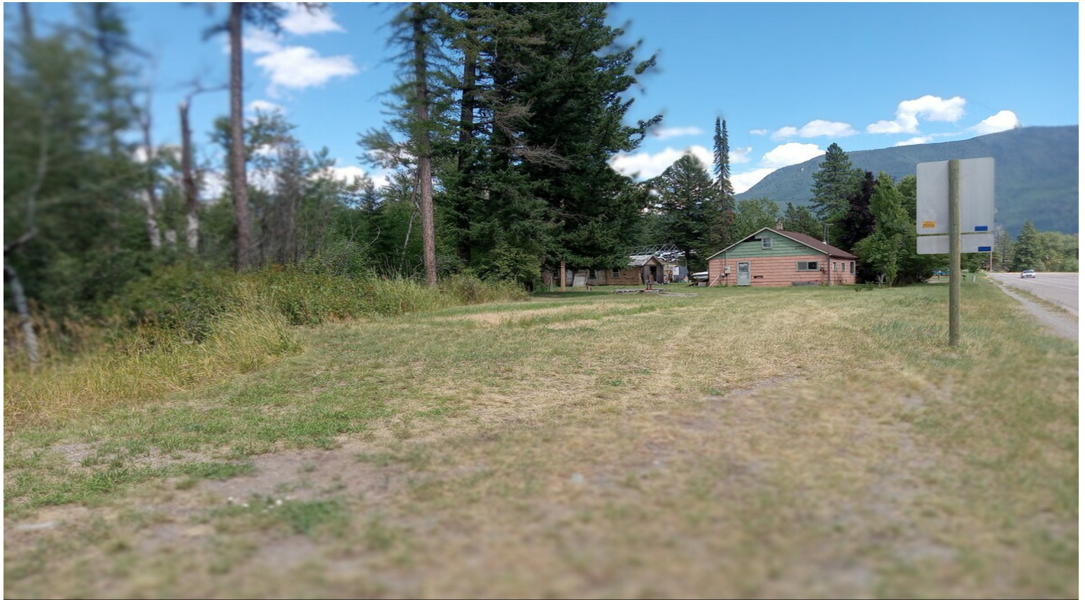
View East from West property mark