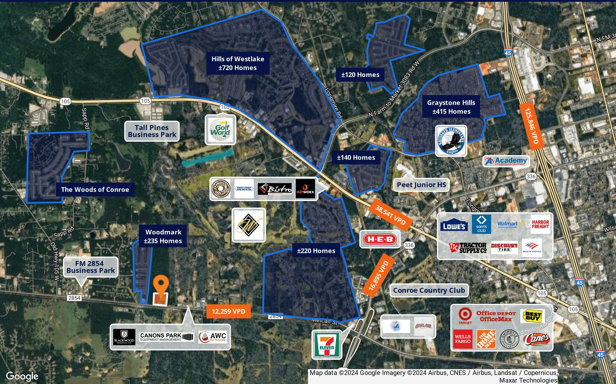
Map data ©2024 Google Imagery ©2024 Airbus, CNES / Airbus, Landsat / Copernicus, Maxar Technologies