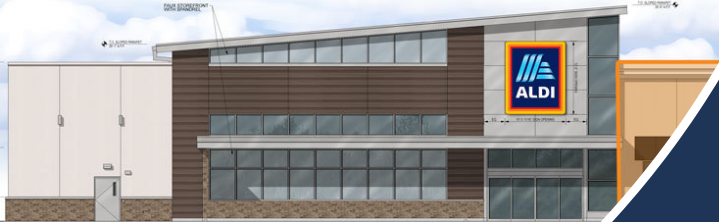
PROPOSED FRONT ELEVATION (OVERALL)