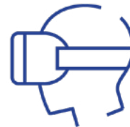
Virtual Reality Zone