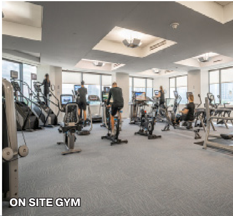
ON SITE GYM