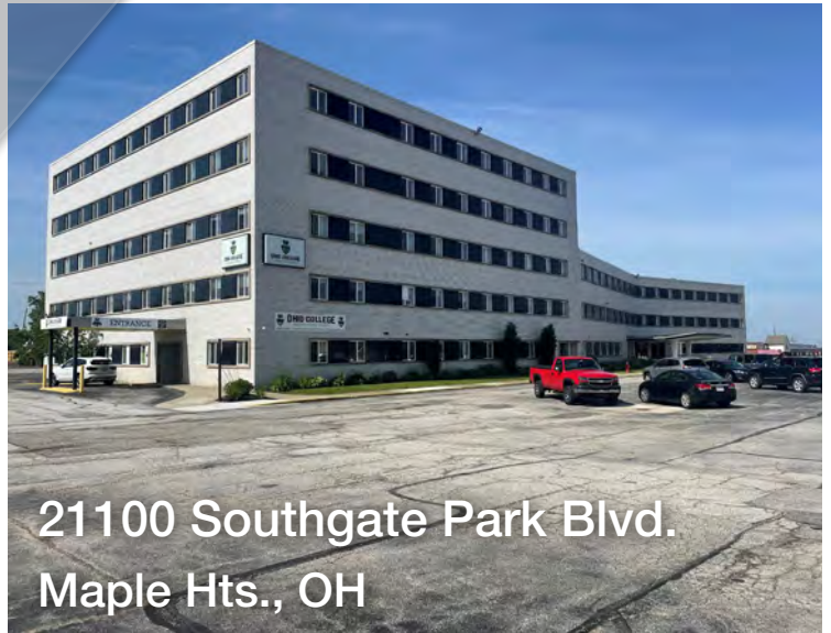
21100 Southgate Park Blvd. Maple Hts., OH

Joe Hauman +1 440 591 3723 joe.hauman@naipvc.com