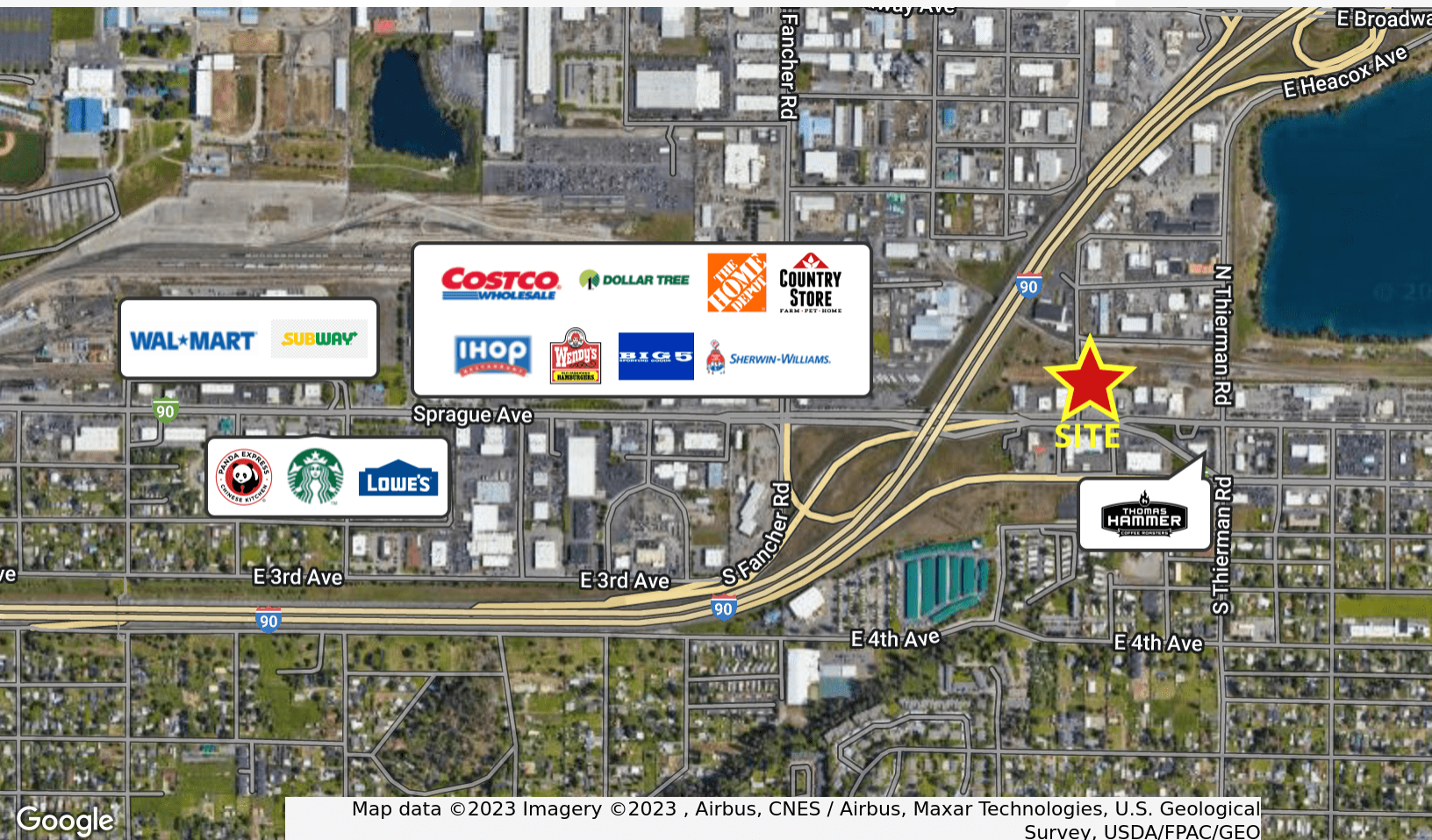
Map data ©2023 Imagery ©2023 , Airbus, CNES / Airbus, Maxar Technologies, U.S. Geological Survey, USDA/FPAC/GEO