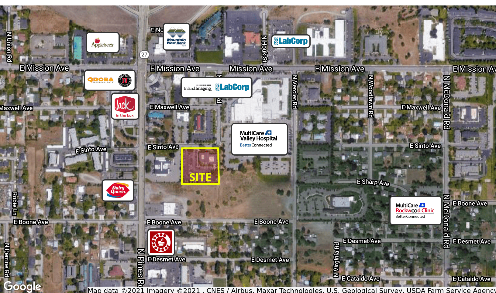
Map data ©2021 Imagery ©2021, CNES / Airbus, Maxar Technologies, U.S. Geological Survey, USDA Farm Service Agency