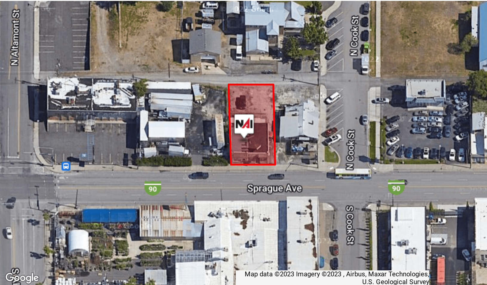
Map data ©2023 Imagery ©2023 , Airbus, Maxar Technologies, U.S. Geological Survey