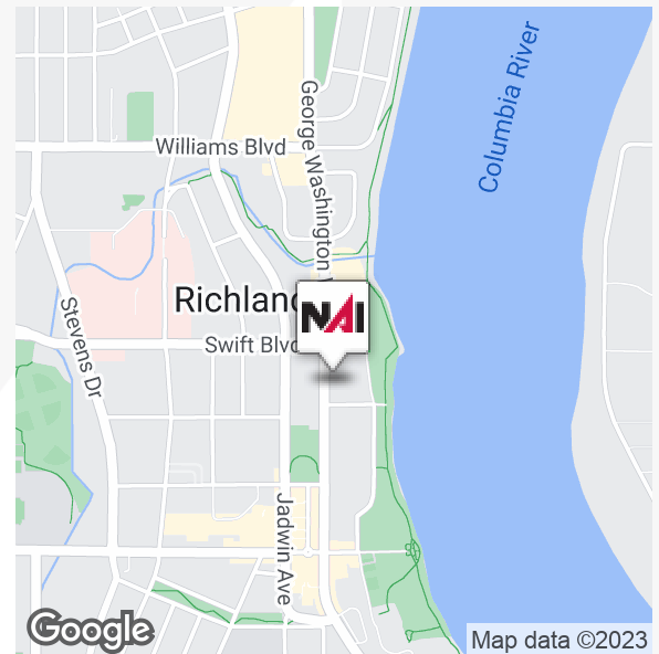
Map data ©2023