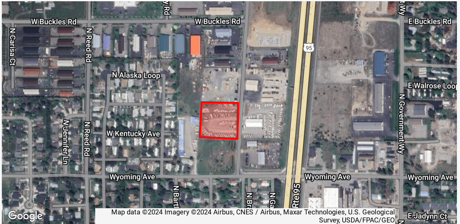
Map data ©2024 Imagery ©2024 Airbus, CNES / Airbus, Maxar Technologies, U.S. Geological Survey, USDA/FPAC/GEO