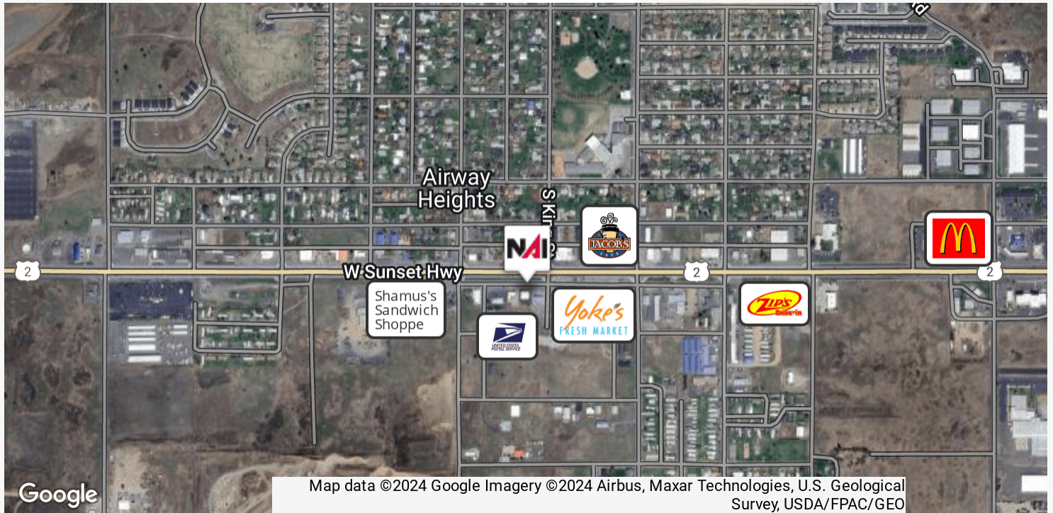
Map data ©2024 Google Imagery ©2024 Airbus, Maxar Technologies, U.S. Geological Survey, USDA/FPAC/GEO