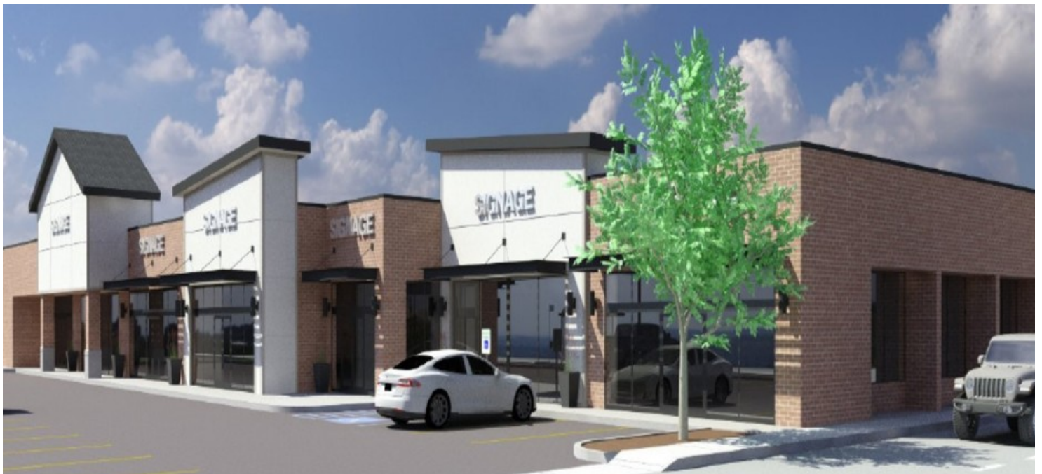
Option 2 - N Francis Avenue Retail Rendering