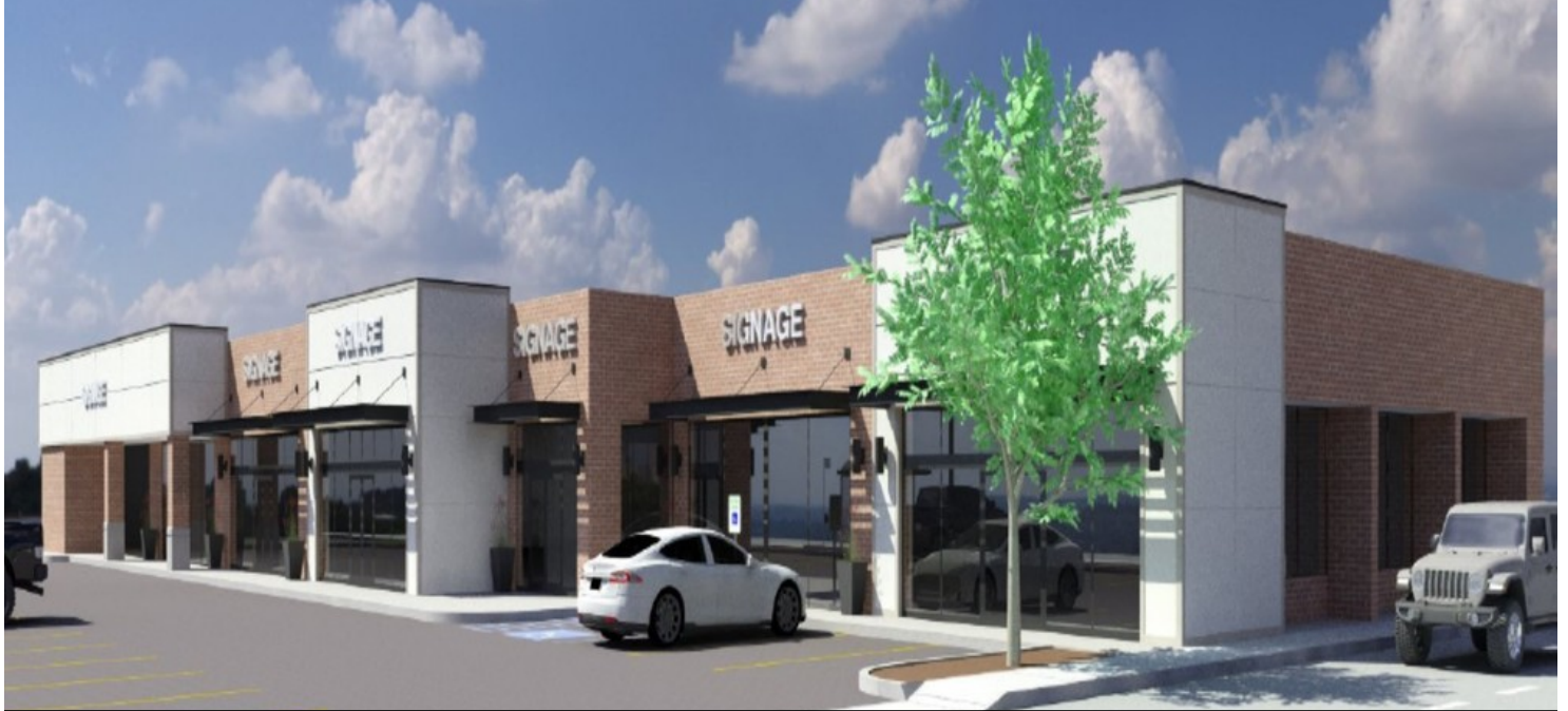
Option 1 - N Francis Avenue Retail Rendering