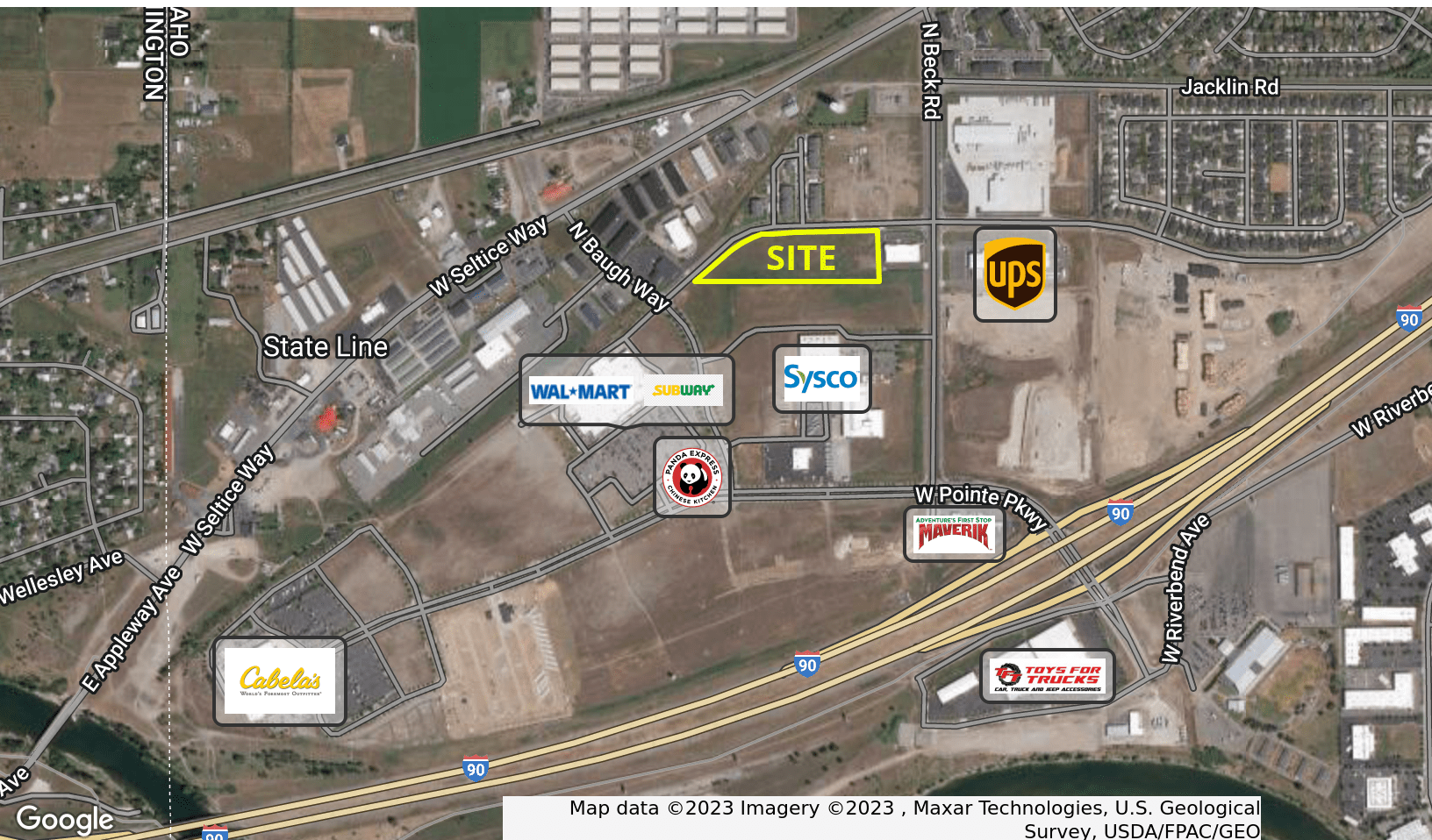
Map data ©2023 Imagery ©2023 , Maxar Technologies, U.S. Geological Survey, USDA/FPAC/GEO