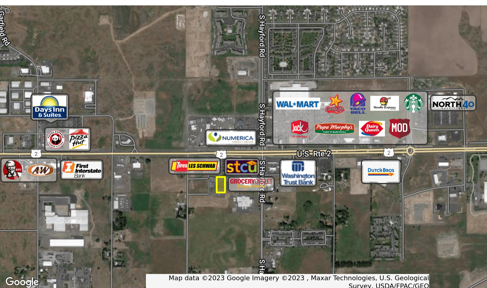
Map data ©2023 Google Imagery ©2023 , Maxar Technologies, U.S. Geological Survey, USDA/FPAC/Geo