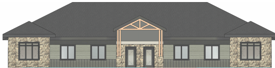
① B1 East 3/32" = 1'-0"