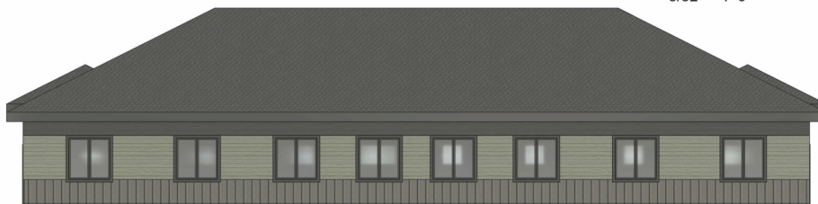
④ B1 West 3/32" = 1'-0"