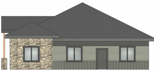
② B1 North 3/32" = 1'-0"