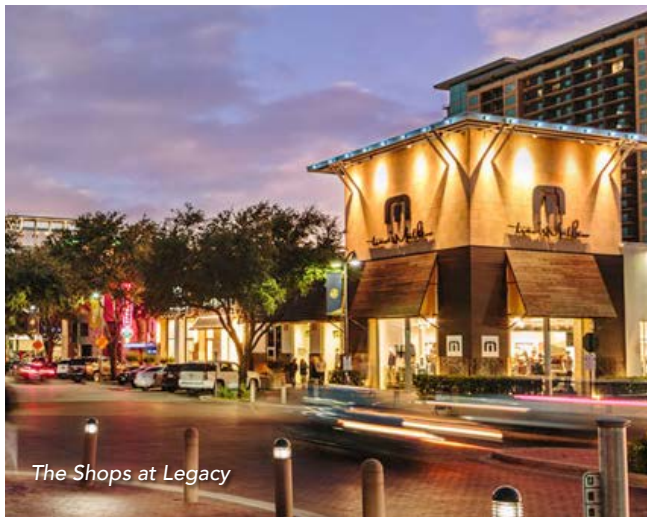
The Shops at Legacy