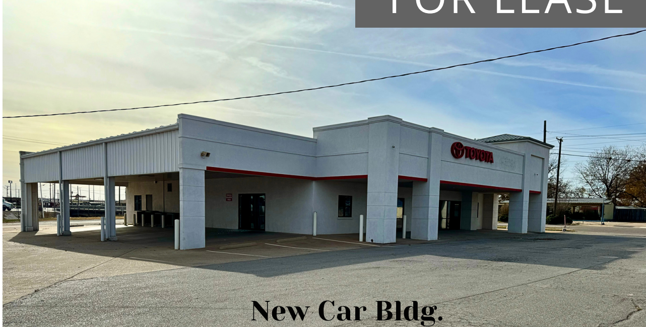
New Car Bldg.

30,676 S.F. in Five Buildings Situating on 8.2 Acres of Land New Car Bldg: 4,760 S.F. Pre-Owned Bldg: 3,550 S.F. Service Bldg: 10,066 S.F. Body Shop I: 7,540 S.F. Body Shop II: 4,760 S.F.