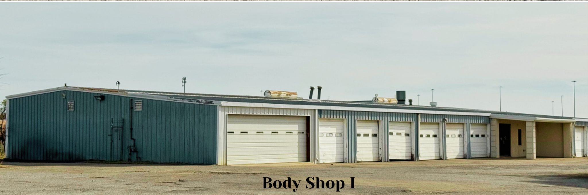
Body Shop I