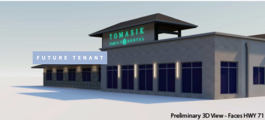
Preliminary 3D View - Faces HWY 71