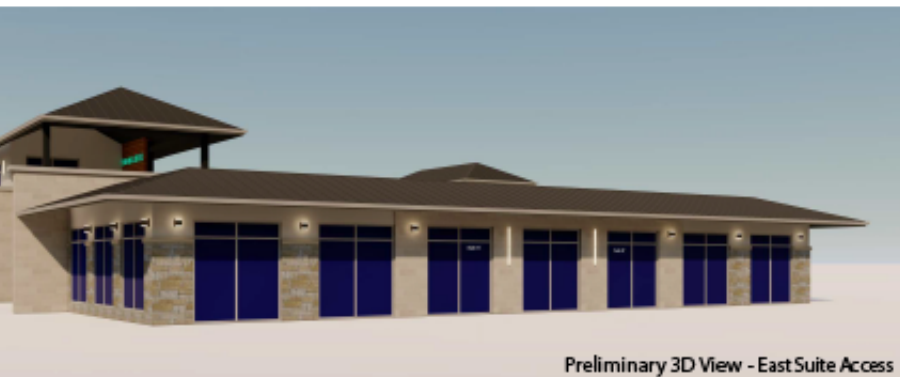
Preliminary 3D View - East Suite Access