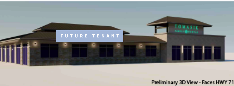
Preliminary 3D View - Faces HWY 71