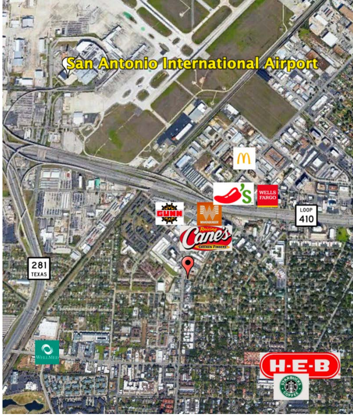
Fronting Broadway, one block South of 410 & Broadway intersection.