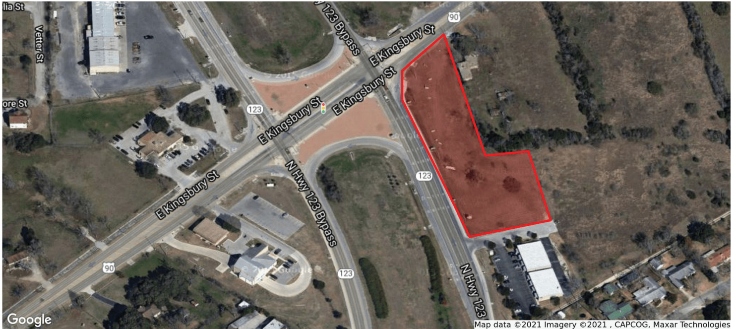
Map data ©2021 Imagery ©2021 , CAPCOG, Maxar Technologies