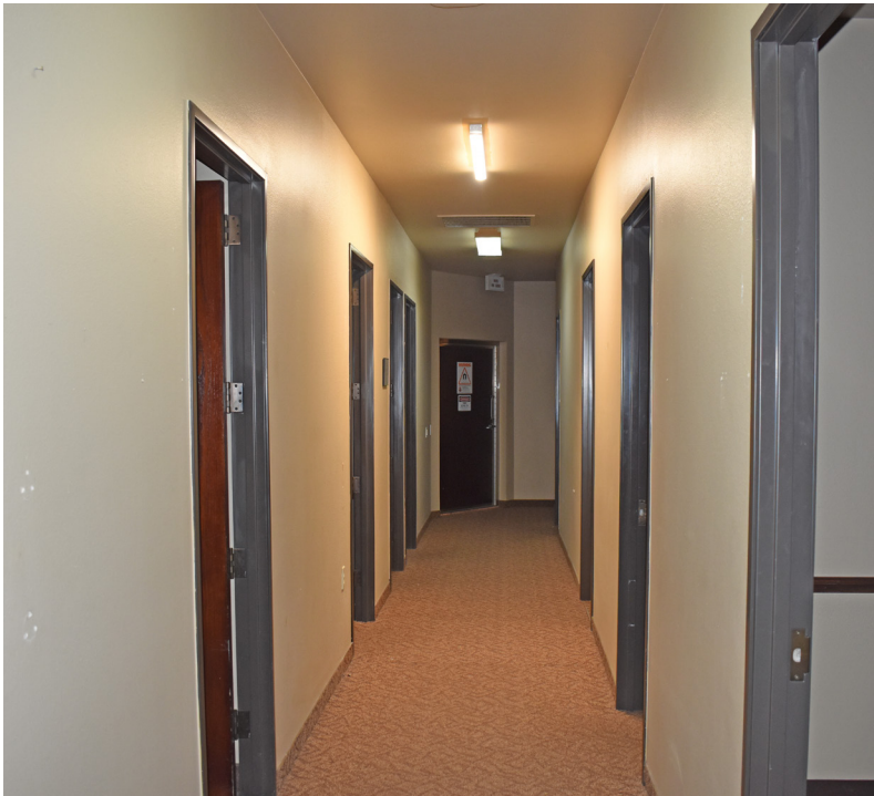
CORRIDOR TO EXAM ROOMS