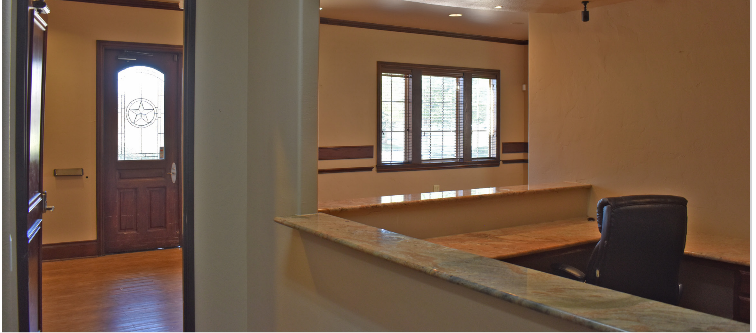
LOBBY & RECEPTIONIST AREA