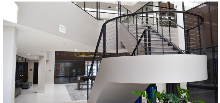
SECOND FLOOR ACCESS