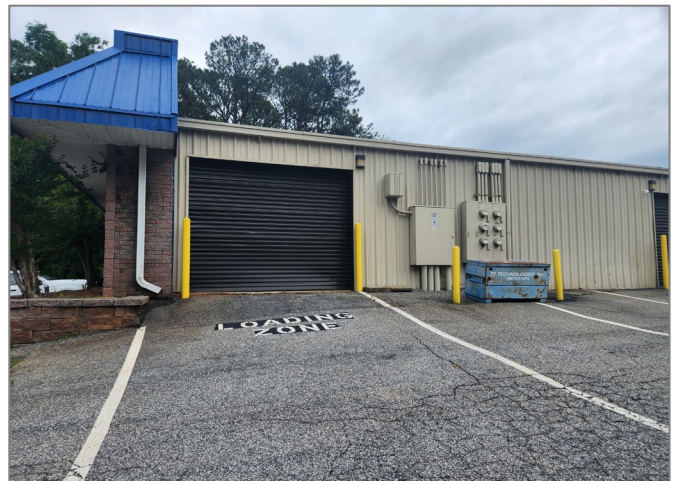
Exterior- Drive-in Door at Rear