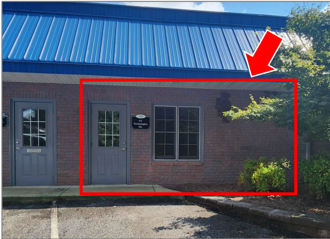
Building Front- Suite 106