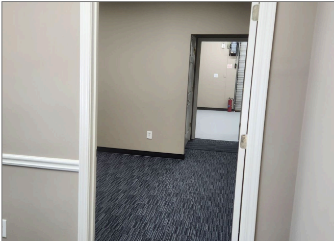
View from Reception to Warehouse