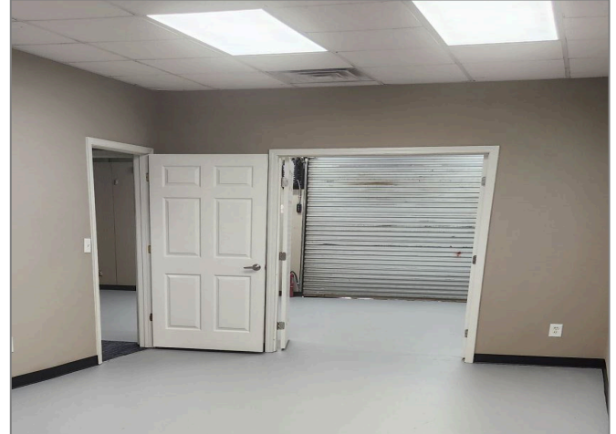
View from Main Office to Warehouse