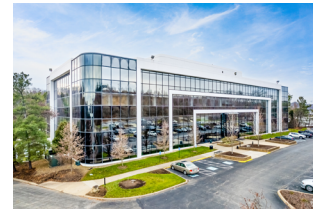
FOUR PENN CENTER WEST