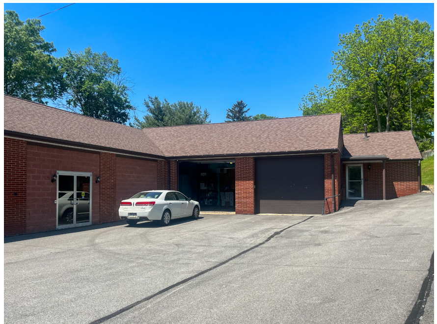
Former municipal building of North Franklin Township