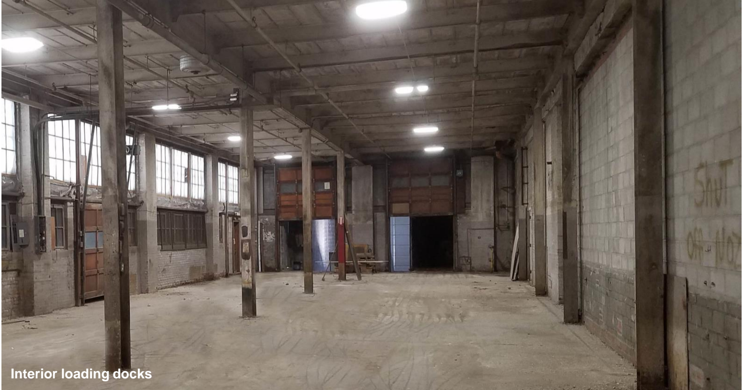
Interior loading docks