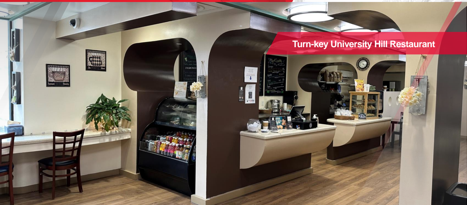
Turn-key University Hill Restaurant