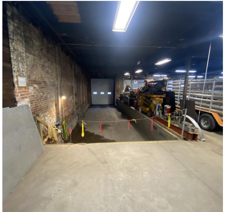
Loading Dock Interior