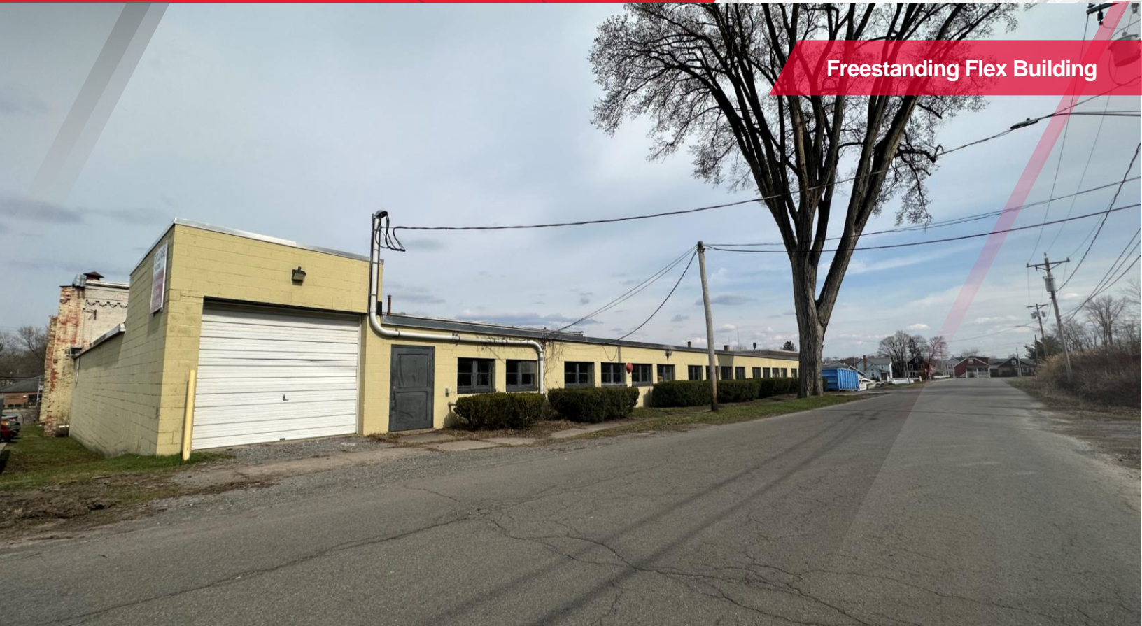
Freestanding Flex Building