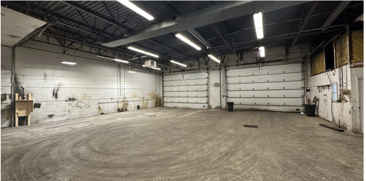
Warehouse – 12' x 18' Overhead Doors