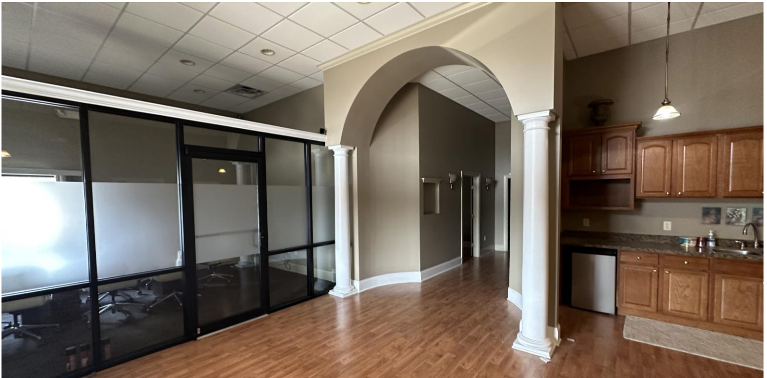
Office - Reception