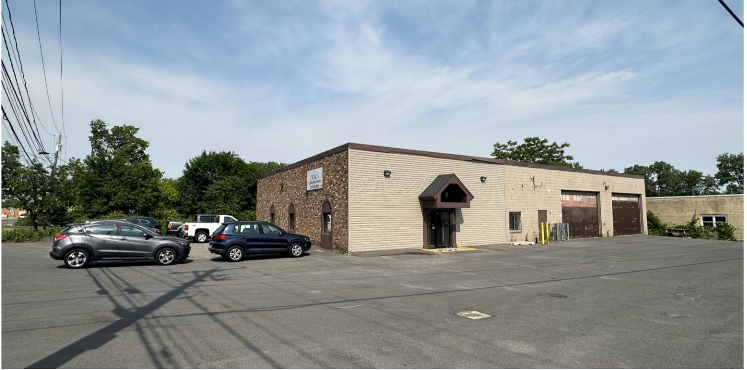
Large Corner Lot