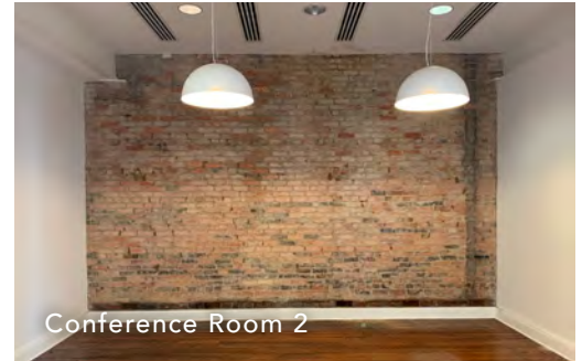
Conference Room 2