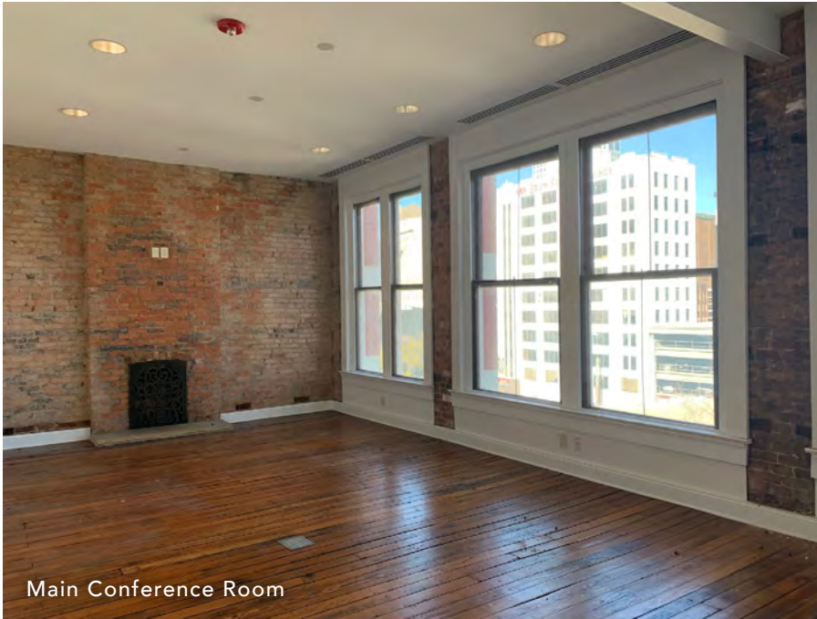
Main Conference Room

Ideal location on 4th floor along highly sought after 2nd Ave N