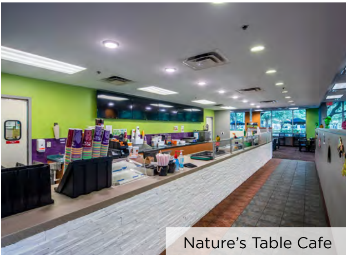
Nature's Table Cafe