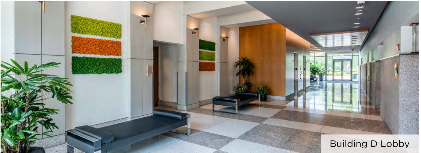
Building D Lobby