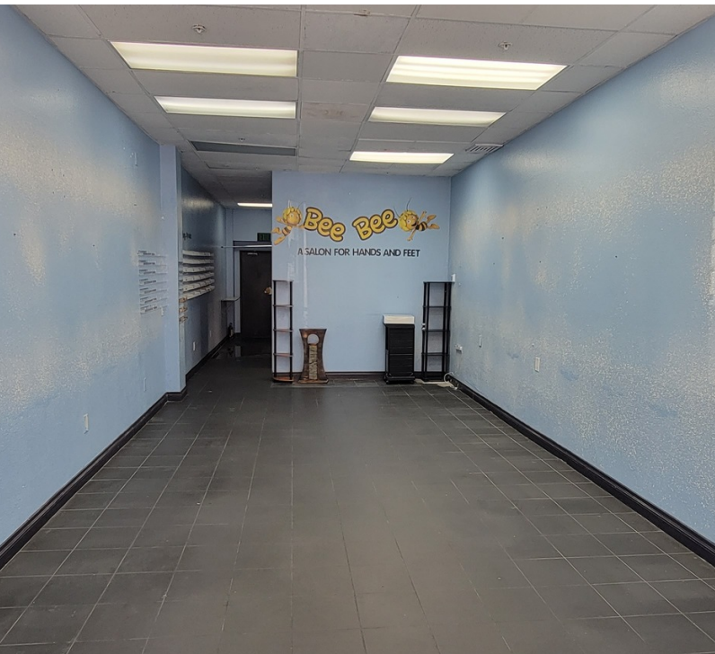
Suite F - 875 SF