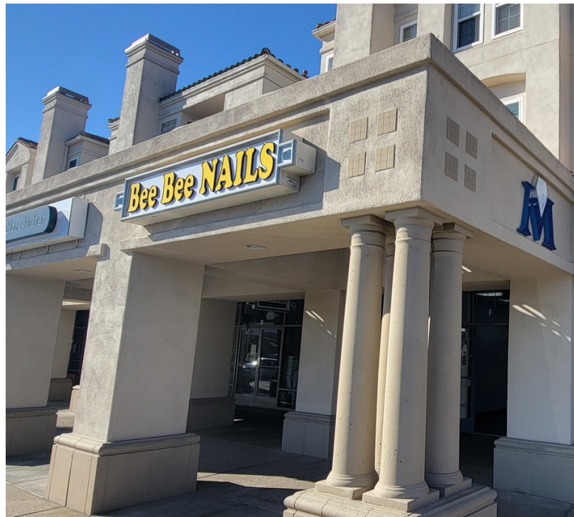
Suite F - 875 SF