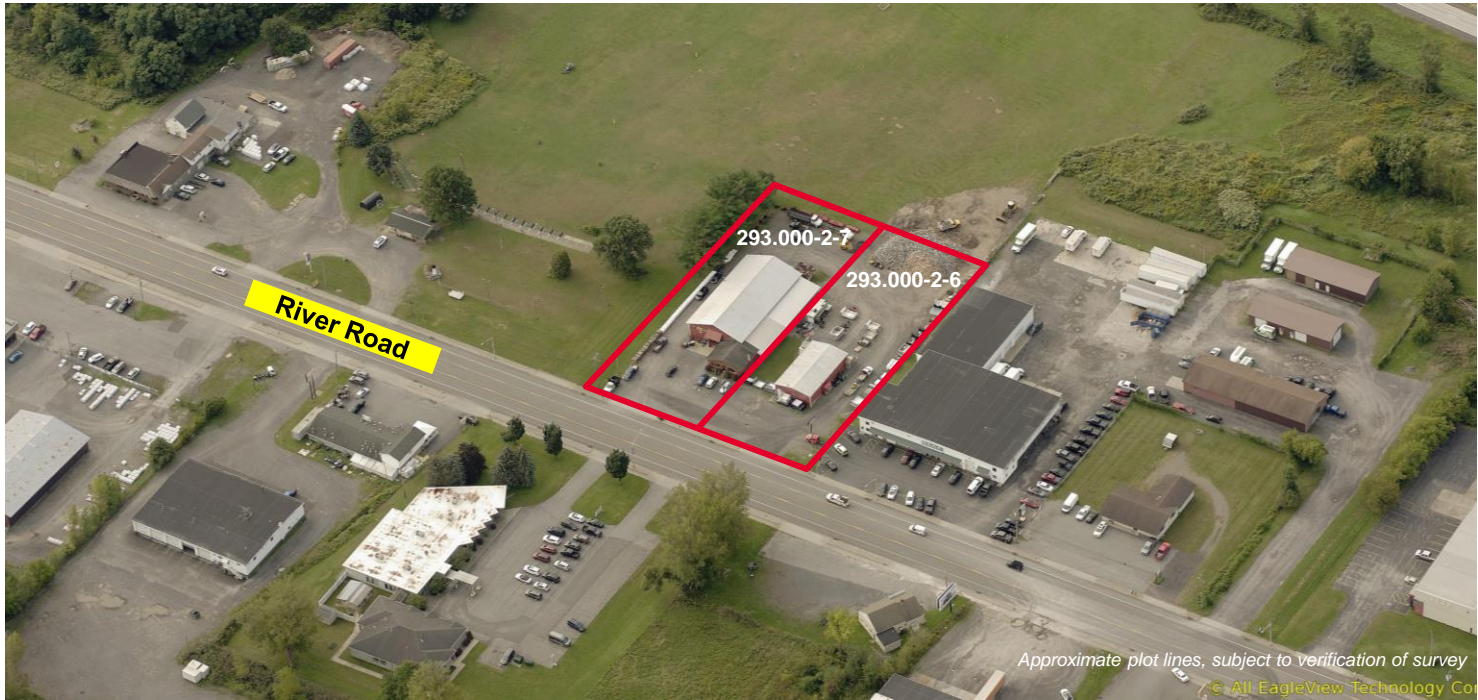
Approximate plot lines, subject to verification of survey © All EagleView Technology Co