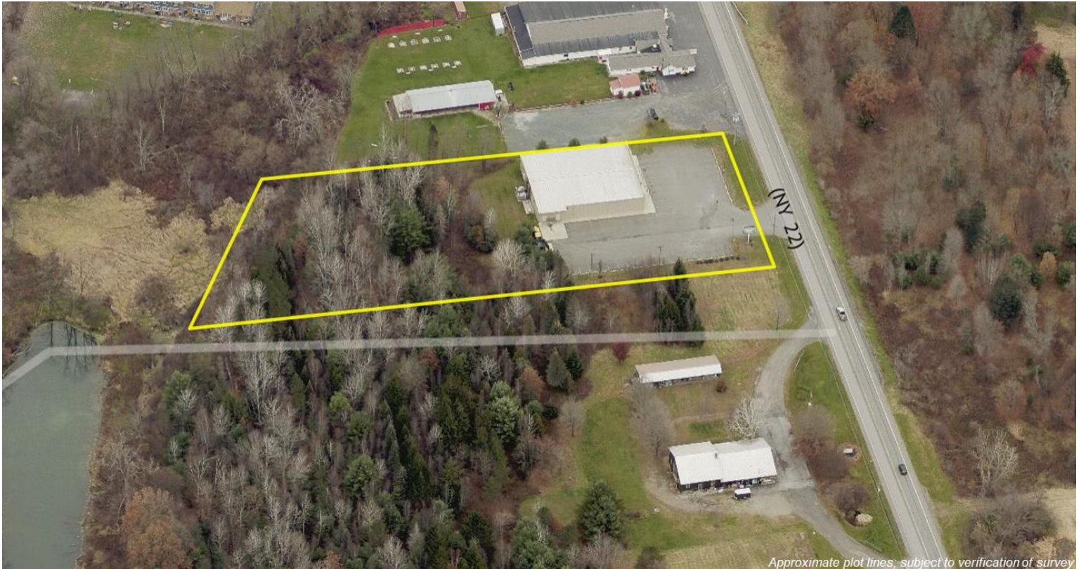
Approximate plot lines, subject to verification of survey