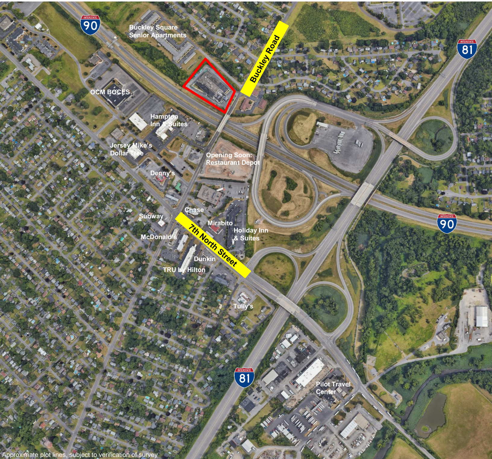
Approximate plot lines, subject to verification of survey

Independently Owned and Operated / A Member of the Cushman & Wakefield Alliance