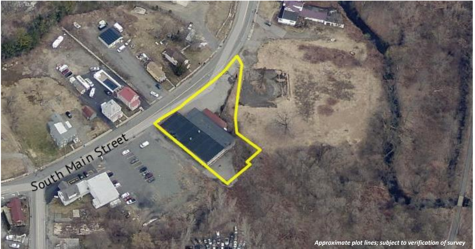
Approximate plot lines; subject to verification of survey