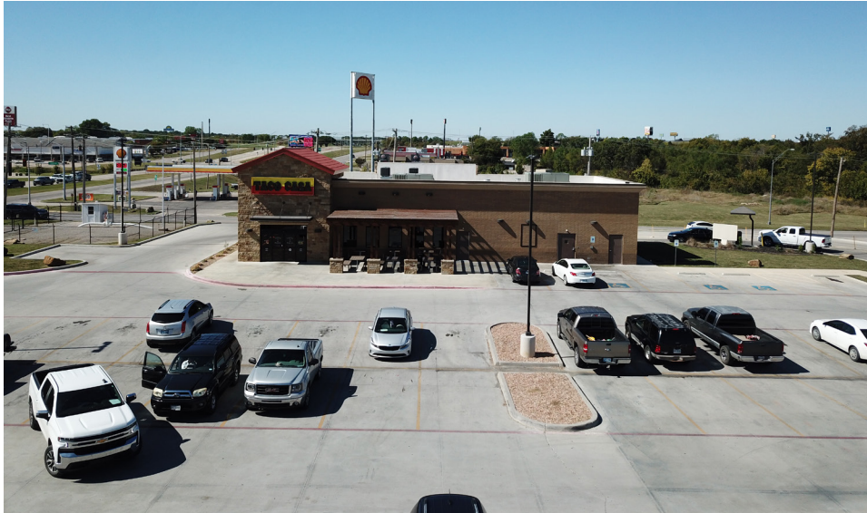
2435 W. Broadway Street, Ardmore, Oklahoma 73401