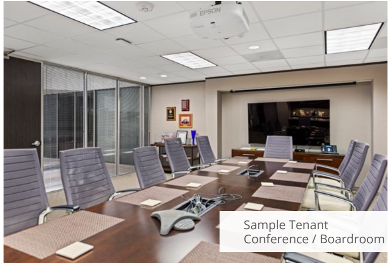
Sample Tenant Conference / Boardroom