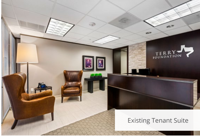
Existing Tenant Suite