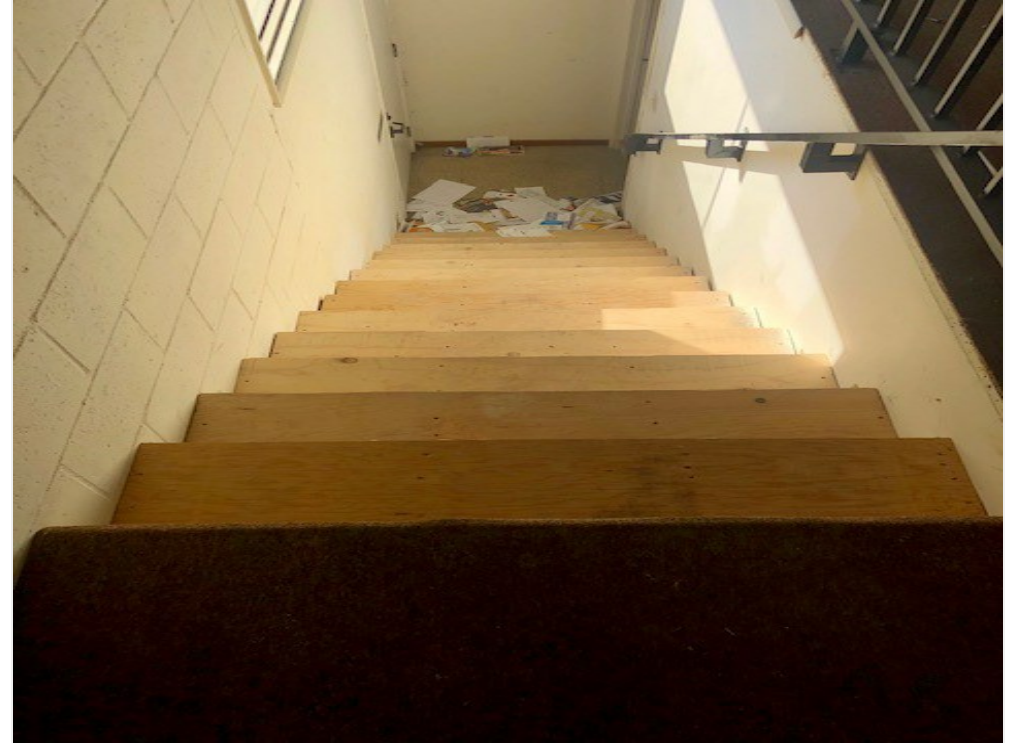
Stairs leading to the office