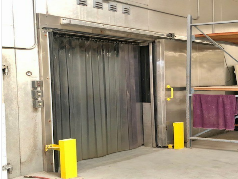
cold storage #3