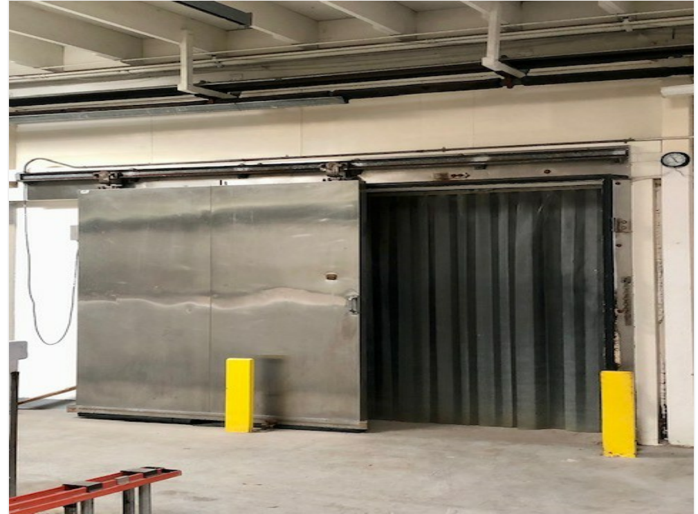
cold storage #2