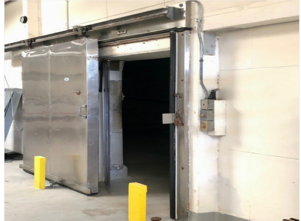
cold storage #4