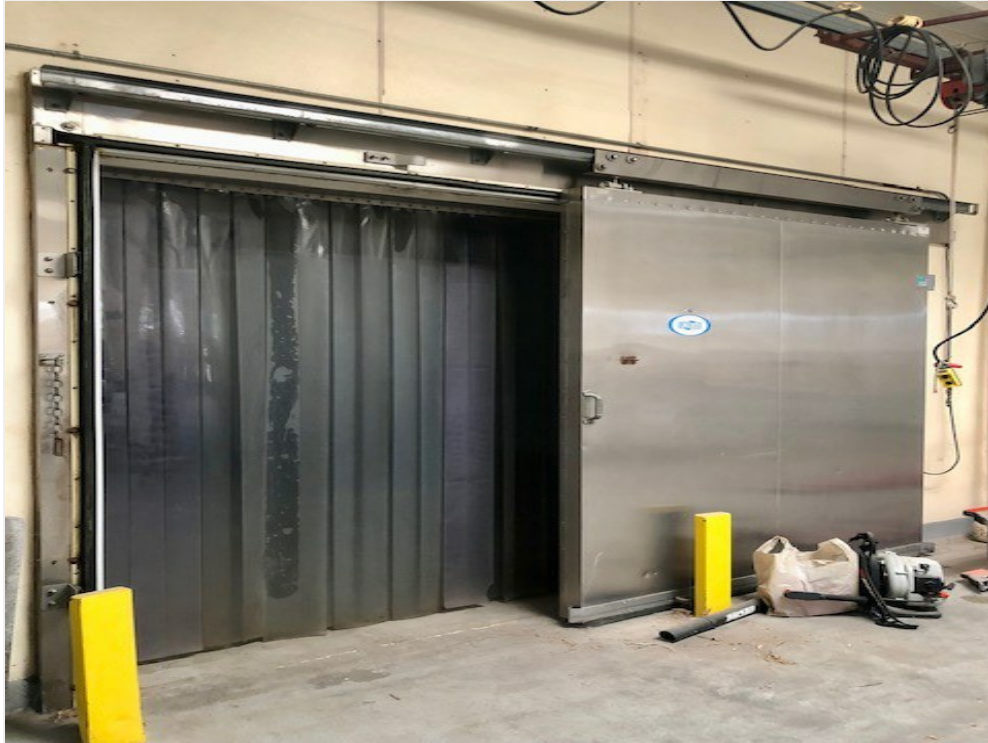
cold storage #1