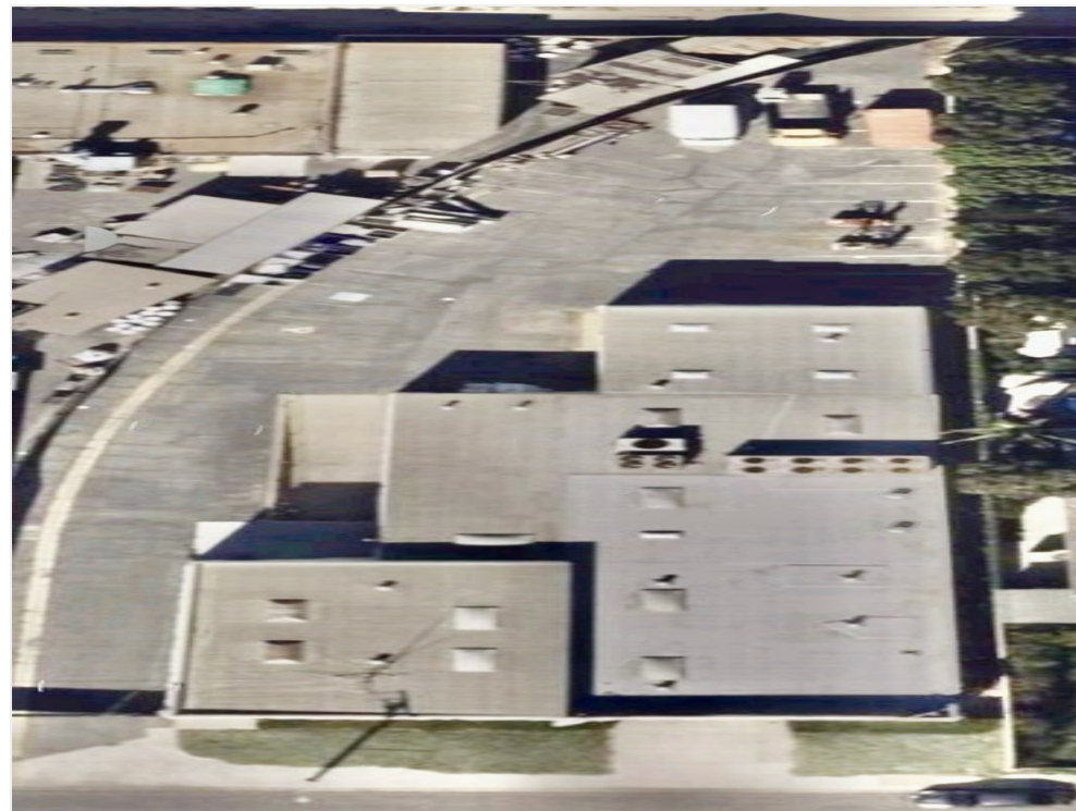
20 parking space