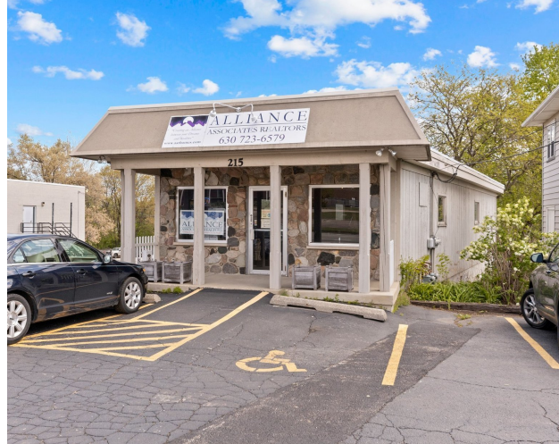
215 S Lincolnway - Alliance Associates Realtors