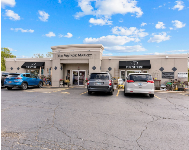
211 S Lincolnway - Vintage Market