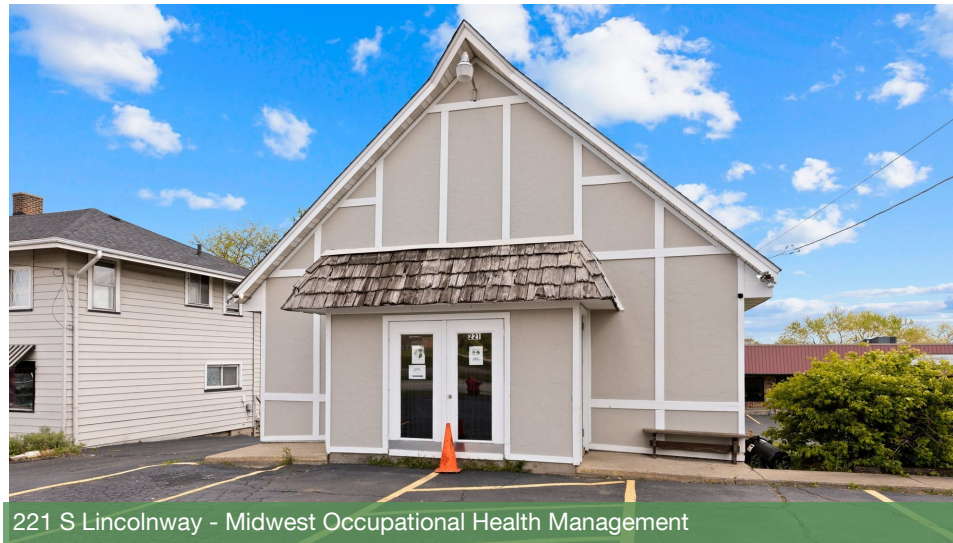
221 S Lincolnway - Midwest Occupational Health Management