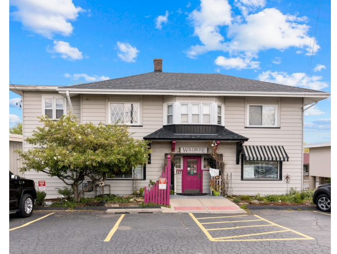
217 S Lincolnway - Wild Rose