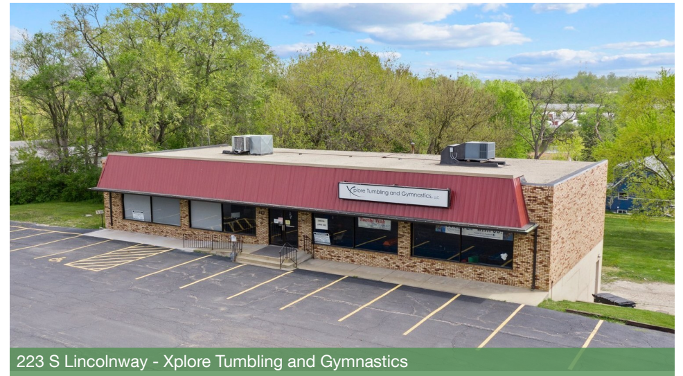
223 S Lincolnway - Xplore Tumbling and Gymnastics