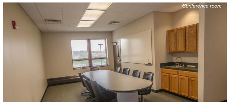
2nd Conference Room