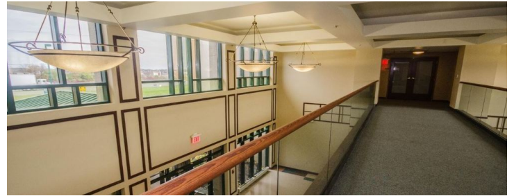
2nd Floor Lobby